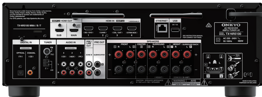
Text on receiver may vary with region.